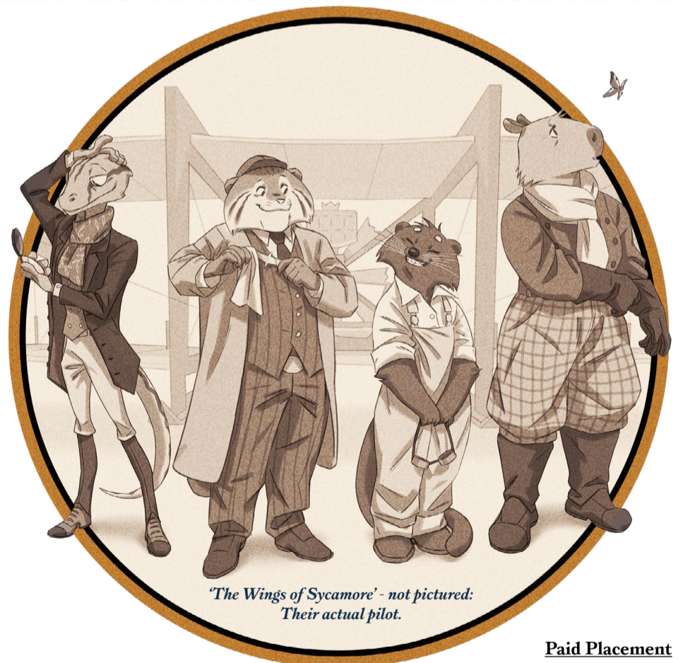
‘The Wings of Sycamore’ - not pictured: Their actual pilot.

Turn To Page 3 For The Remarkable Full Interview.